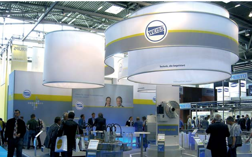
Friendly, bright, open: The bright and welcoming new WEISS trade fair stand.

Munich: WEISS was a resounding success at Automatica. WEISS presented selected products and demonstrated their interaction with one another at a new stand at the trade fair, which took place in Munich between 10 and 13 June. The level of interest from visitors was astonishingly high, with the sheer number of interested visitors at the stand exceeding even the most optimistic expectations.